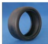
Re Series Tire