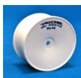
Light weight Dish Wheel No.240