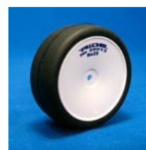
No. 26013 Re25