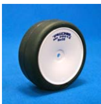
No. 26012 Re28