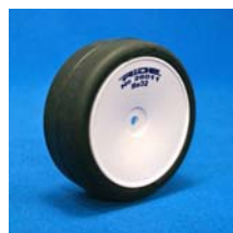
No. 26011 Re32