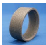
MS24-LT Inner Light weight type