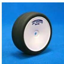
No. 26010 Re 36